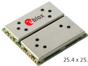
25.4 x 25.4 x 3 mm

The TIM-4R is a dead reckoning GPS module powered by the 16-channel ANTARIS 4 engine. Dead reckoning works by combining GPS satellite position data, gyroscope data (that measures angle turns) and odometer data (that measures distance covered) to calculate a position. This enables accurate navigation in locations with poor or lacking GPS such as tunnels, indoor parking facilities and deep urban canyons. This makes the TIM-4R the ideal solution for applications requiring an accurate positioning solution that provides road coverage positioning 100% of the time.